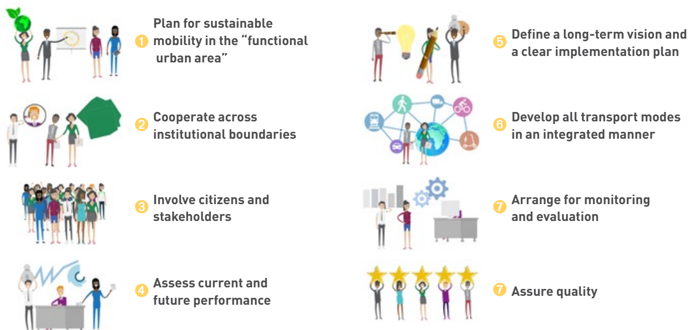
Figure 1 The eight SUMP principles.