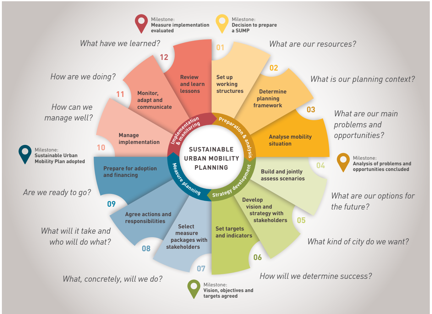
Figure 2 The SUMP planning cycle.

The SUMP Guidelines 2.0 offer concrete suggestions on how to apply the SUMP concept and prepare an urban mobility strategy that builds on a clear vision for the sustainable development of the entire urban area. This process of developing and implementing a SUMP can be broken down into 12 main steps that are also relevant for public transport planning.